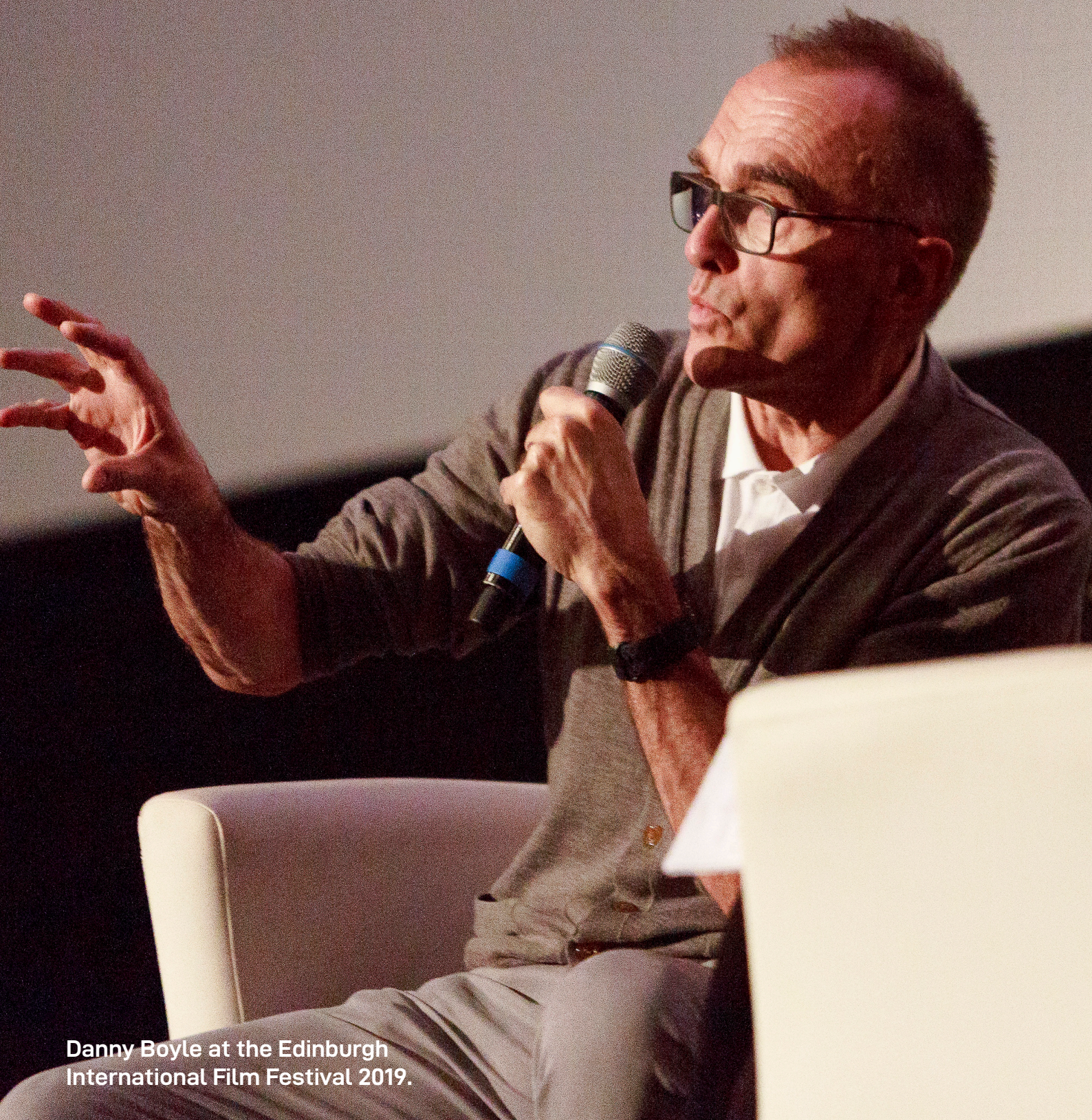
Danny Boyle at the Edinburgh International Film Festival 2019.