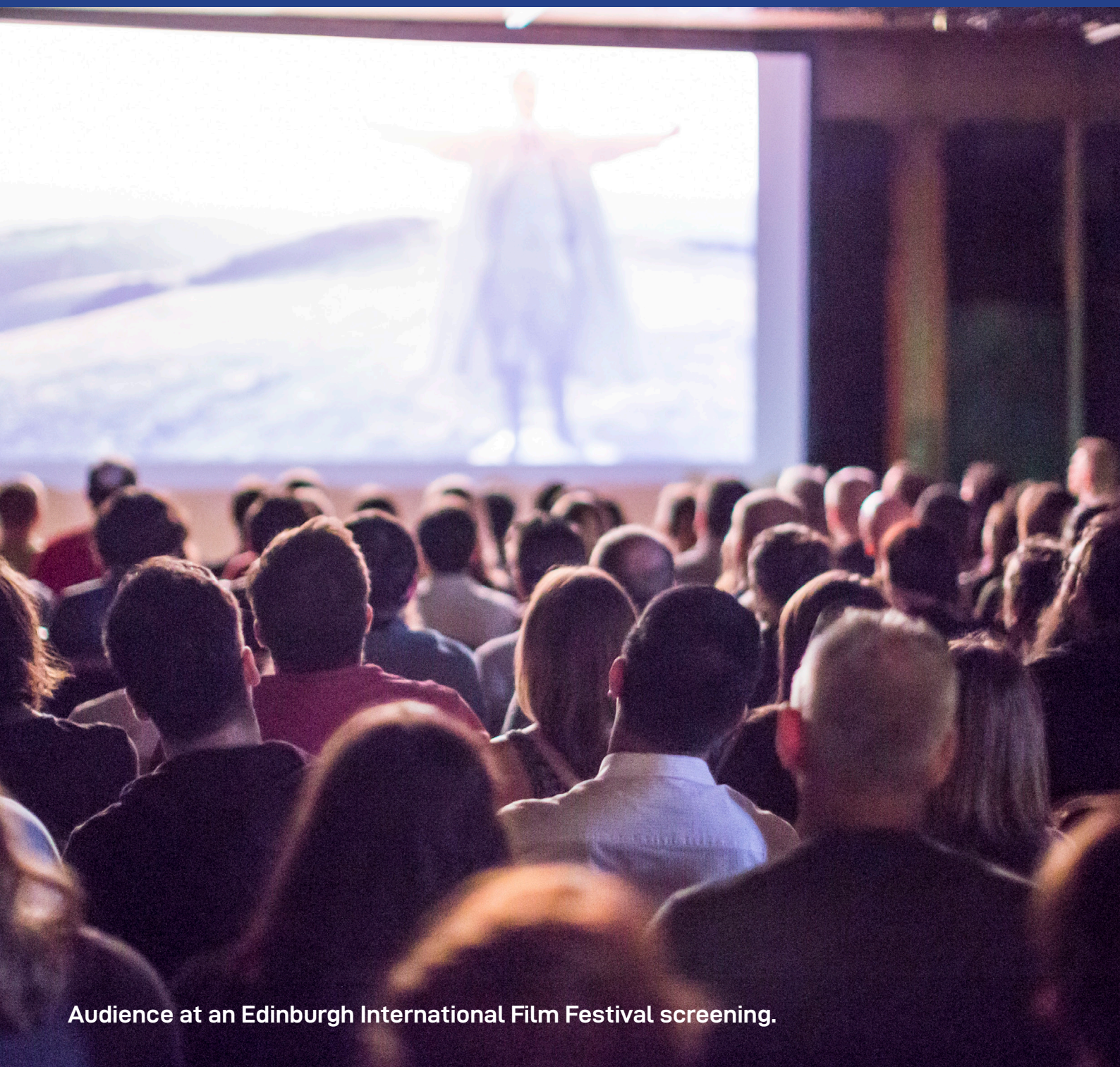
Audience at an Edinburgh International Film Festival screening.

Below you can see how CMI generates income and where we spent our funds in 2018/19. The vast majority of our spending goes towards the most integral part of CMI, the artistic and creative programme at Filmhouse, Belmont and EIFF.