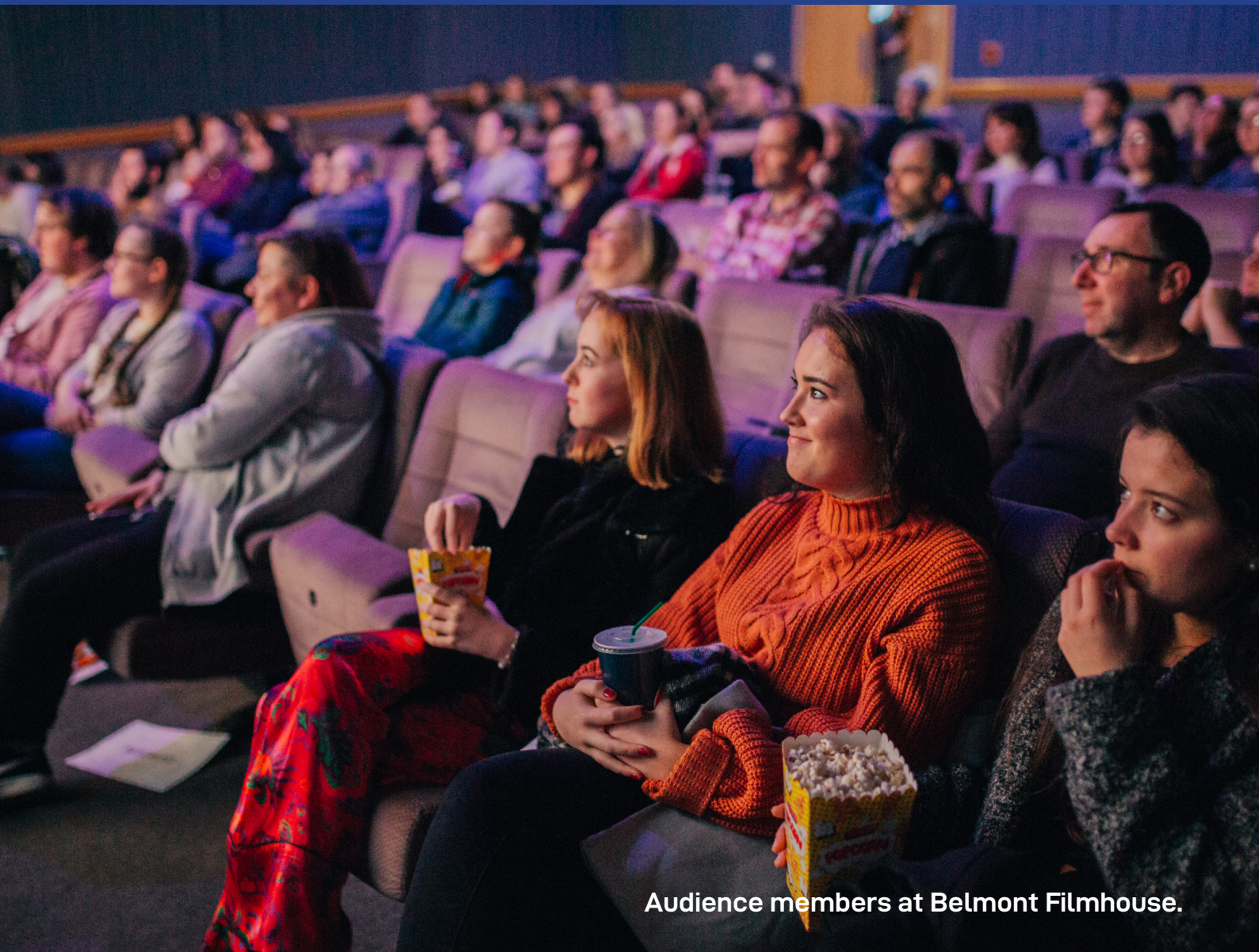
Audience members at Belmont Filmhouse.

“Now more than ever we need to talk to each other, to listen to each other and understand how we see the world, and cinema is the best medium for doing this.” - Martin Scorsese