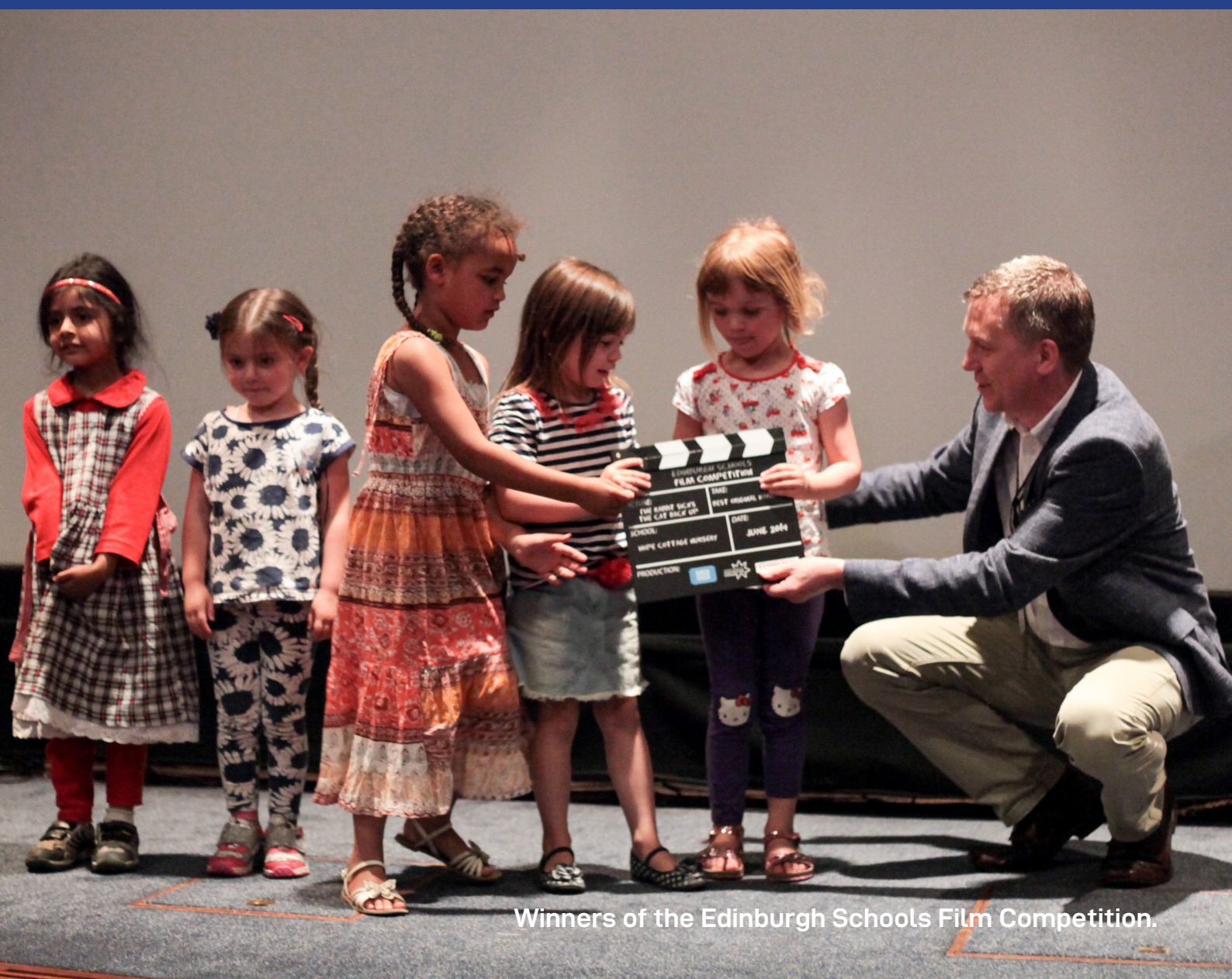
Winners of the Edinburgh Schools Film Competition.

Our work develops and enhances the range and quality of opportunities for people to be inspired by, and engage with, film and the moving image with a year round programme of screenings, discussions, festivals, workshops, industry support, education and talent development programmes, and the chance to meet filmmakers from around the world.